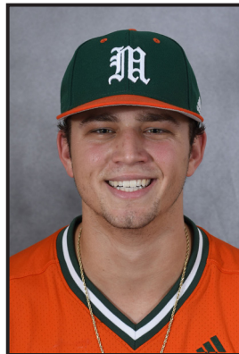
Game 1: RHP Slade Cecconi 5-3, 4.44 ERA, 48.2 IP