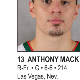
Wyoming/Blair Academy (N.J.)