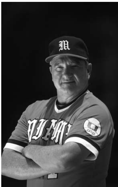
Remembering "The Wizard of College Baseball"