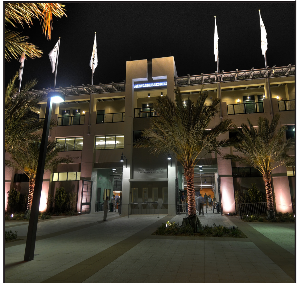
ALEX RODRIGUEZ PARK AT MARK LIGHT FIELD

Renovations to Mark Light Field were thanks in large part to a $3.9 million contribution by New York Yankees third baseman Alex Rodriguez. The official announcement of his gift was made on Oct. 10, 2002, while the park reopened as "Alex Rodriguez Park at Mark Light Field" in 2009.