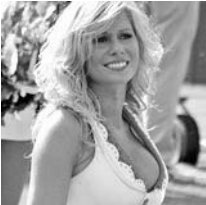
Dolphins cheerleaders are an absolute force