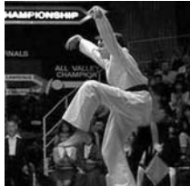
10 most unrealistic sports movie scenes

Please note by clicking on "add a comment" you acknowledge that you have read the Terms of Use and the comment you are posting is in compliance with such terms. Be polite. Inappropriate posts may be removed by the moderator.