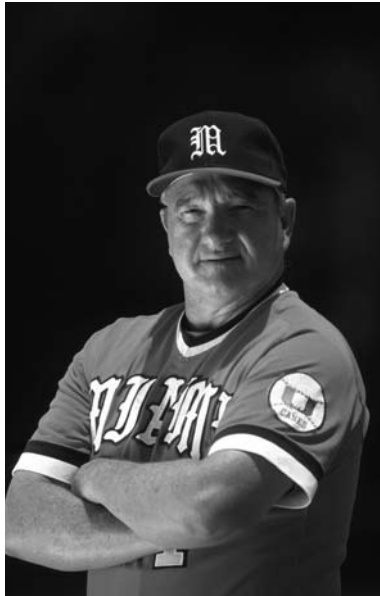
Remembering "The Wizard of College Baseball"