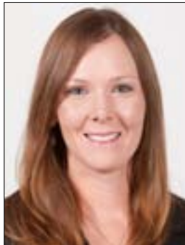
Amy Woodruff Communications