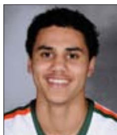
0 Shane Larkin Fr. | G | 5-11 | 160 Cincinnati, Ohio Dr. Phillips (Fla.)