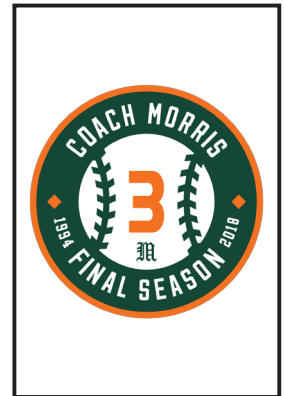
Game 3: TBA