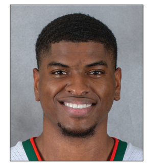
Sr. • G • 6-7 • 207 St. Petersburg, Fla. Lakewood Senior HS