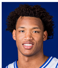
0 | Wendell Moore Jr. F | Fr. | 6-6 | 213 Charlotte, N.C.