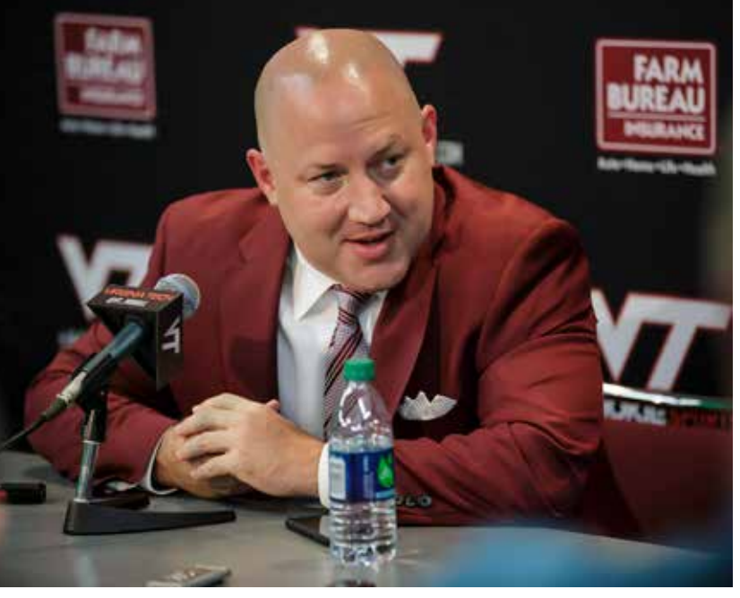
Virginia Tech vs. Miami Notes • Page 11