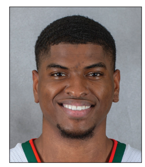
Sr. • G • 6-7 • 207 St. Petersburg, Fla. Lakewood Senior HS