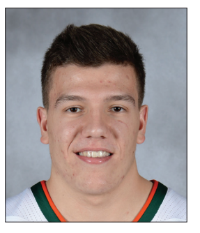
Jr.• G• 6-3• 184 Melbourne, Australia Australian Institute of Sport