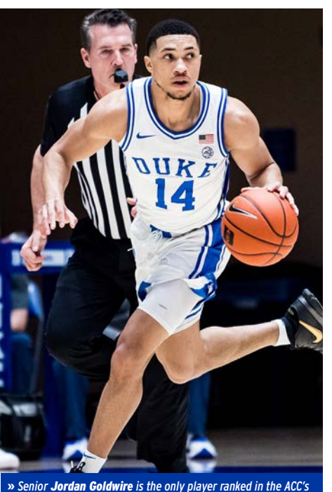
top 10 for assist/turnover ratio, steals and assists.