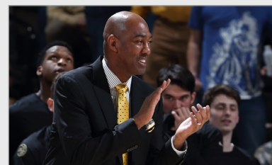
6th Season at Wake Forest | Kansas, 1991