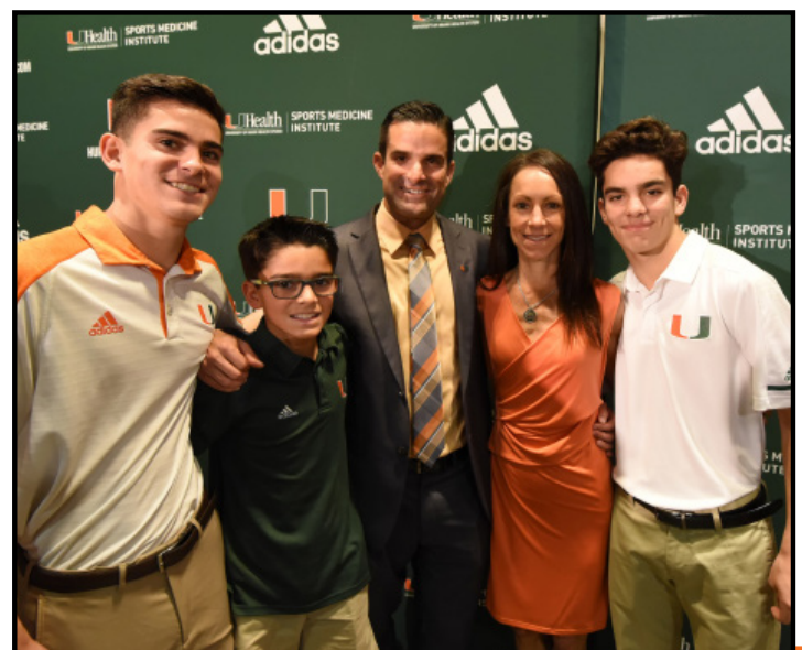
GAME FIVE - VIRGINIA