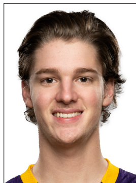
10 GRAY WEAVER