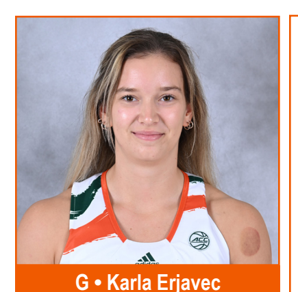
Sr. • 5-10 • Zagreb, Croatia

· Has posted double-figures in four of her last six games and ranks second on the Canes in scoring this season (8.6)