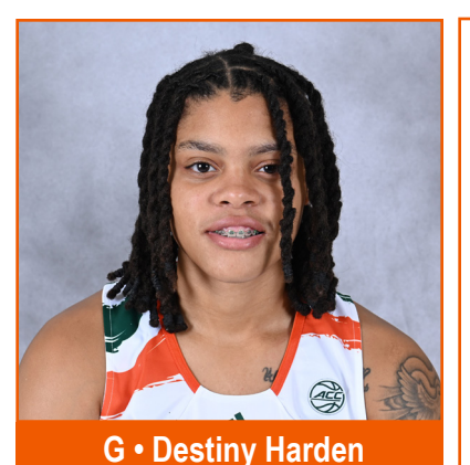
R-Sr. • 6-0 • Chicago, III.