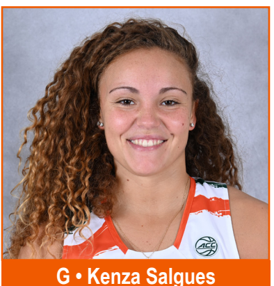
Jr. • 5-9 • Montpellier, France