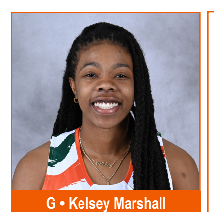
Gr. • 5-9 • Davie, Fla.