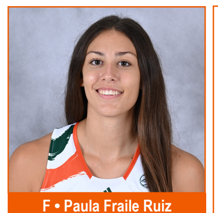
So. • 6-4 • Barcelona, Span