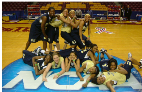
The Yellow Jackets made it to the NCAA Tournament in 2007 which was the first of six-straight appearances in the Big Dance from 2007-12.

Big 12: 1-3 BIG EAST: 2-1 Big Ten: 1-3 Mid-American: 1-0 Northeast: 1-0 SEC: 0-2 Southland: 1-0 Sun Belt: 0-1