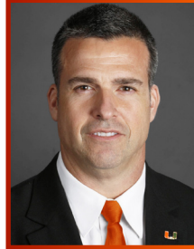
MARIO CRISTOBAL FOOTBALL