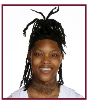
G, 6-0, GR. Chattanooga, Tenn. Kentucky