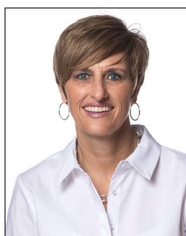
Teri Moren Head Coach