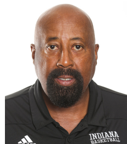
MIKE WOODSON Head Coach Second Year at IU 44-25