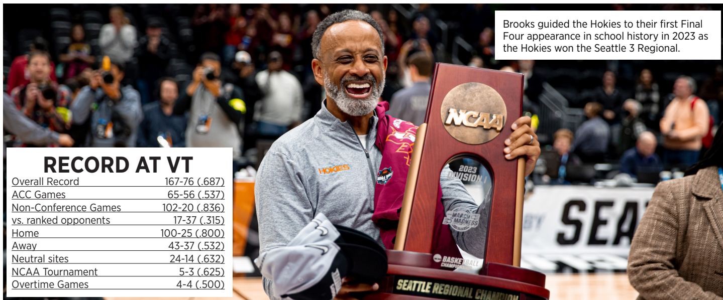
Brooks guided the Hokies to their first Final Four appearance in school history in 2023 as the Hokies won the Seattle 3 Regional.