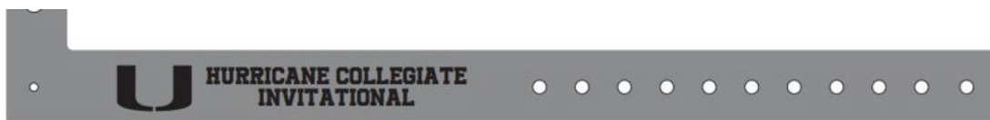
Visiting Team Athletes (Hurricane Collegiate Invitational)