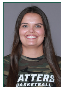
DPS Madison Pack Third Season