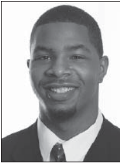
22 Marcus Morris Fr. / F / 6-8 / 225 Philadelphia, Pa. (Prep Charter HS/ APEX Academy [N.J.]

Last Game: Jan. 24 at Iowa State Minutes: 19 Points: 0 Rebounds: 6 Assists: 0