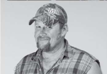
Marlon Brando (1924–2004) Academy Award-winning actor