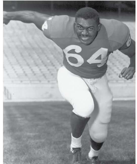
Nebraska’s most recently retired jersey was Bob Brown’s (below) No. 64, which was permanently retired following his introduction into the Pro Football Hall of Fame in 2004.