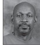
Sol Morton Building Services Technician