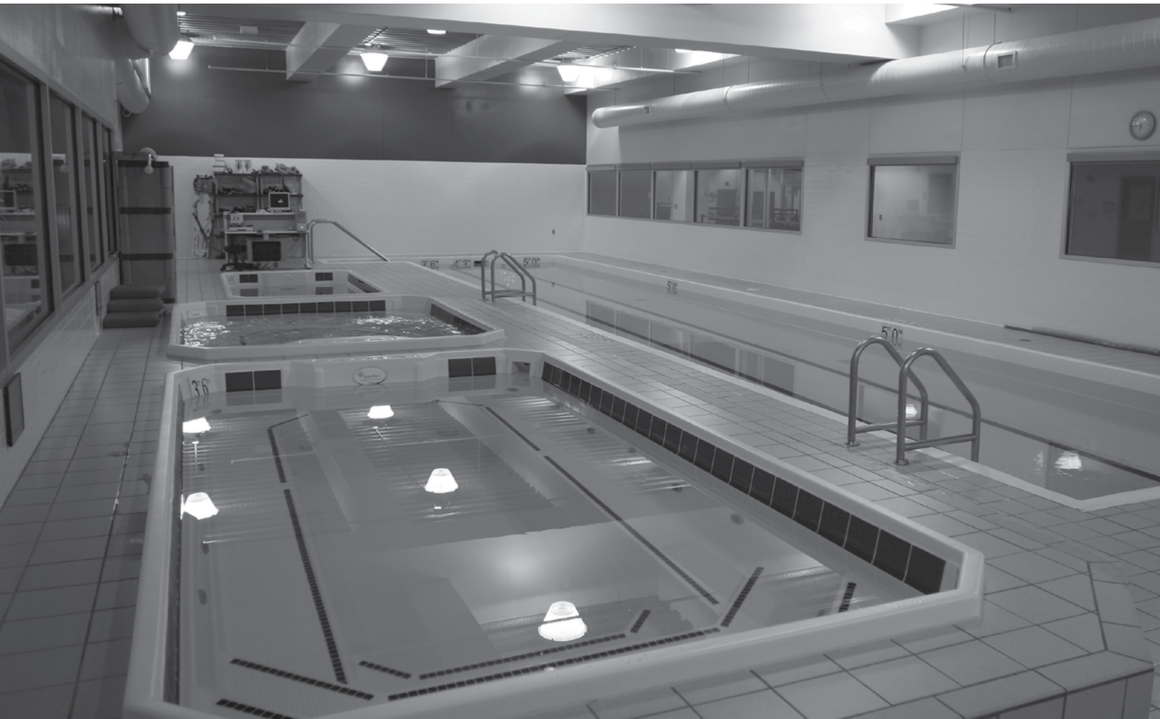
The Athletic Medicine Center features a hydrotherapy area that includes a three-level laned pool, which allows student-athletes across all of Nebraska's sports to work out simultaneously. The Hydroworx 1000 Treadmill Pool is equipped with two cameras underwater for evaluation and assessment, while hot and cold plunge tanks are also available to the Huskers.