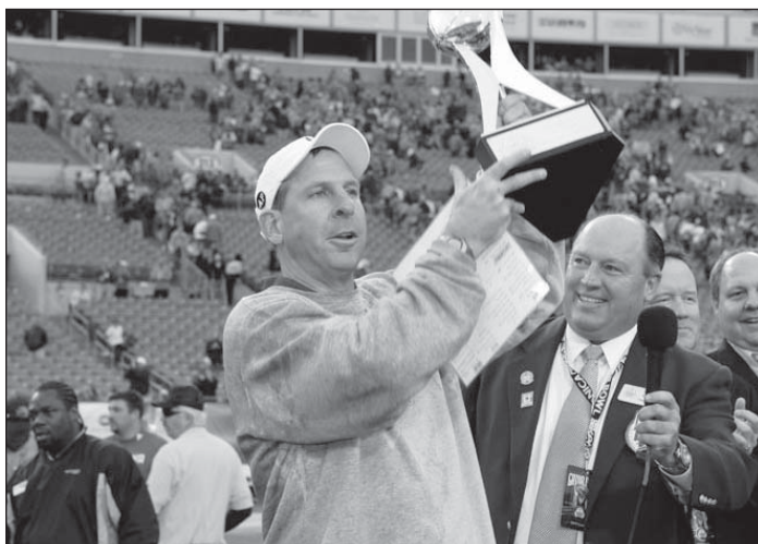
Head Coach Bo Pelini joined Bob Devaney, Tom Osborne and Frank Solich as Nebraska coaches winning a bowl game in their first season with the Huskers.