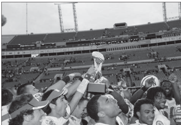
Nebraska's victory over Clemson marked the Cornhuskers' 23rd all-time bowl victory in 45 appearances.