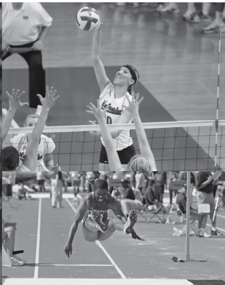
Top: Jordan Larson was a three-time All-American on the court while leading Nebraska to three trips to the NCAA Semifinals in her career, including the 2005 national title. In a stellar senior season, Larson earned her second straight first-team All-America award, while claiming third-team CoSIDA Academic All-America honors and being named the Big 12 Player of the Year and the Big 12 Defensive Player of the Year.