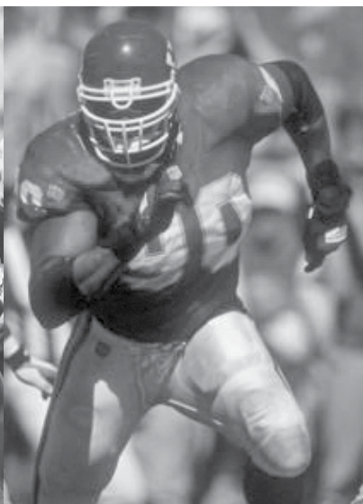
Neil Smith , Defensive Tackle 1988-2000 (Chiefs, Broncos, Chargers) Second Overall Pick in 1988 NFL Draft Six-Time Pro Bowl Selection 104.5 Career Sacks Two Super Bowl Championships with Denver Broncos