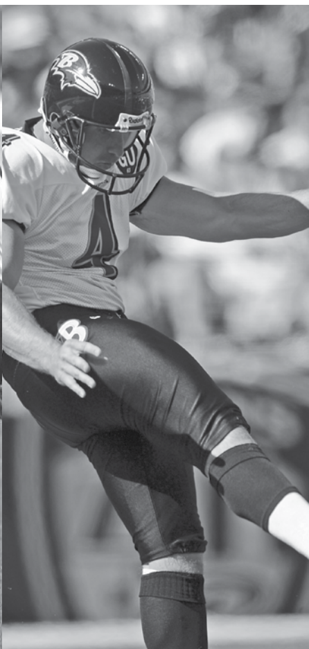
Sam Koch Baltimore Ravens Punter 45.0 yards per punt in 2008