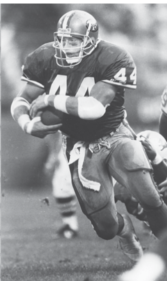
Tom Rathman , Fullback 1986-1994 (49ers, Raiders) Two Super Bowl Championships with San Francisco 49ers 2,020 Career Rushing Yards, 320 Career Receptions