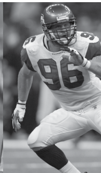
Grant Wistrom , Defensive End 1998-2006 (Rams, Seahawks) Sixth Overall Pick in 1998 NFL Draft 53 Career Sacks Three Super Bowl Appearances