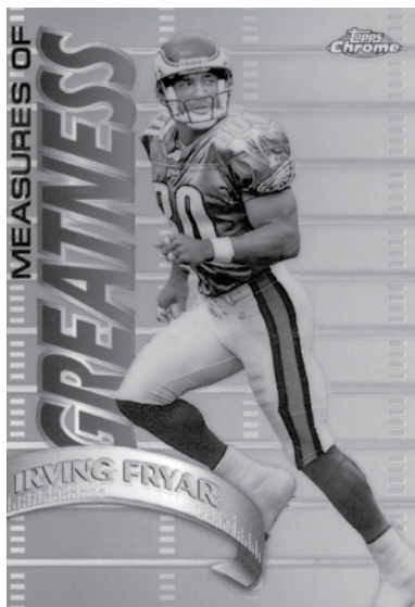
Irving Fryar , Wide Receiver 1984-2000 (Patriots, Dolphins, Eagles, Redskins) 1st Overall Pick in 1984 NFL Draft Five-Time Pro Bowl Selection 851 Career Receptions (13th in NFL History)