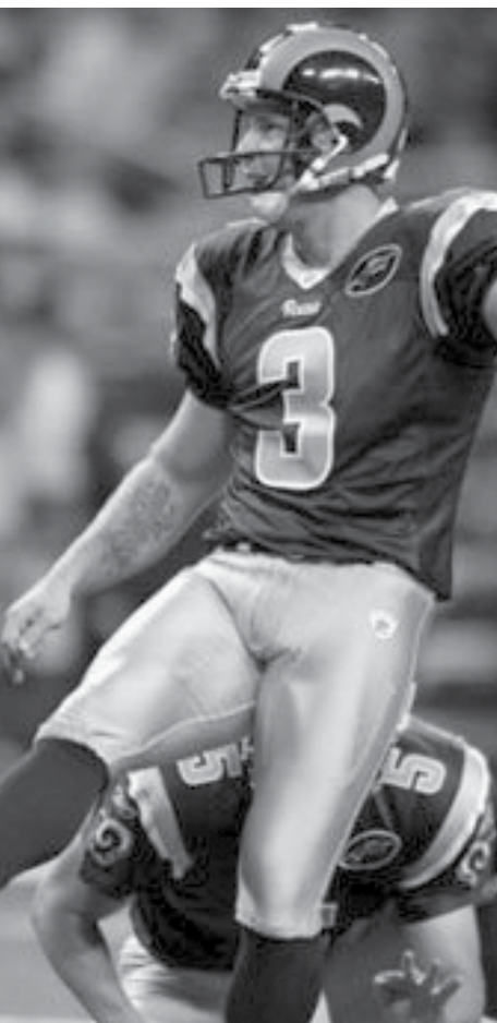
Josh Brown St. Louis Rams Placekicker 683 points since 2003 Ranks fourth among kickers