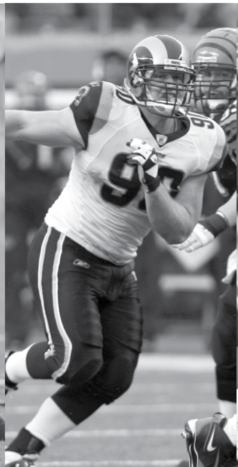
Adam Carriker St. Louis Rams Defensive tackle 2007 first-round pick 85 tackles in two seasons