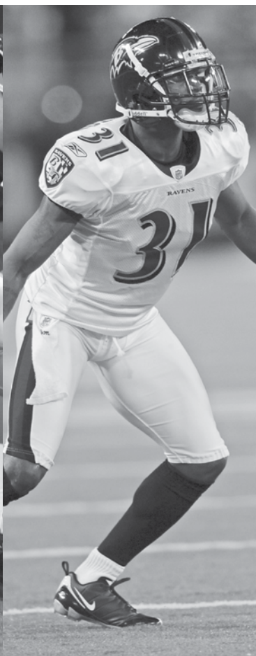
Fabian Washington Baltimore Ravens Cornerback 39 PBU, 154 career tackles