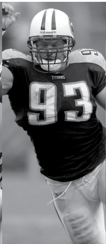
Kyle Vanden Bosch Tennessee Titans Defensive End Two-time Pro Bowler 40.5 career sacks