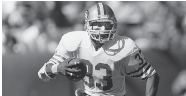
Roger Craig , Running Back 1983-1993 (49ers, Raiders, Vikings) Three Super Bowl Championships with San Francisco 49ers Four-Time Pro Bowl Selection 1980s NFL All-Decade Team 1988 NFL Offensive Player of the Year