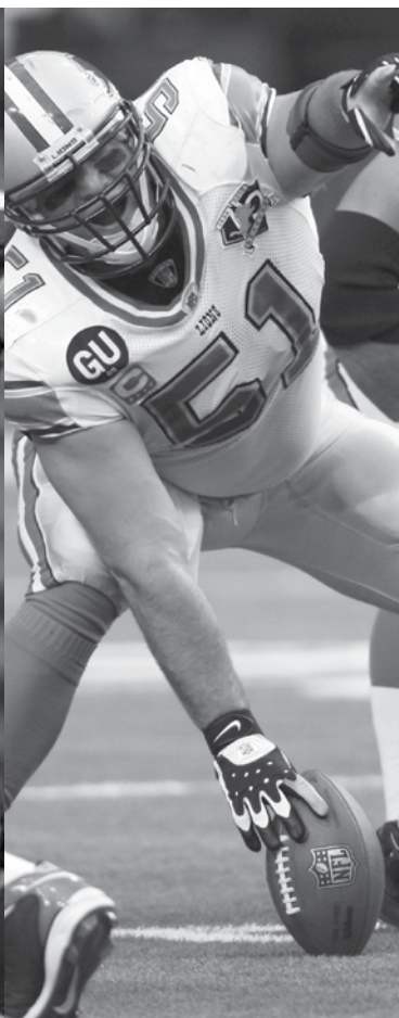
Dominic Raiola Detroit Lions Center Played in 124 games with 108 starts in NFL career