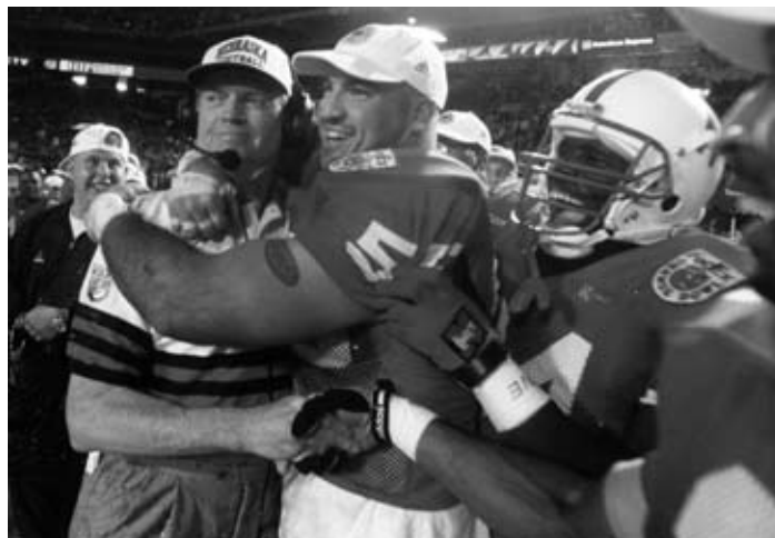
Nebraska's last bowl game in the state of Florida was the 1998 Orange Bowl, when the second-ranked Huskers defeated No. 3 Tennessee, 42-17, to give Head Coach Tom Osborne a share of the national championship in his final game. Nebraska has won its last three bowl games in the state of Florida dating back to 1995.

Bold denotes NU conference champion teams.