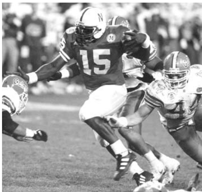
Tommie Frazier had a dazzling 75-yard touchdown run in the third quarter of the 1996 Fiesta Bowl, the longest rush in Nebraska bowl game history. Frazier finished with 199 yards rushing in the No. 1 Huskers' 62-24 national championship victory over No. 2 Florida, which stood as an NCAA bowl game rushing record for a quarterback until 2005.