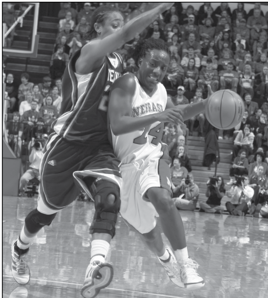
No. 4 Nebraska rolled to a 71-60 win over No. 12 Texas A&M at the Devaney Center on Feb. 6, 2010, by keeping the Aggies off the free throw line. The Huskers held A&M to just 1-of-2 shooting from the line, the second-fewest free throws made by an opponent in school history. NU outscored A&M 16-1 at the line.