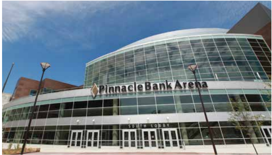
Nebraska enters its third season at Pinnacle Bank Arena in 2015-16. The Big Red have ranked No. 11 nationally in average attendance each of the past two seasons, attracting more than 6,000 fans per game.

The mission of the University of Nebraska Athletic Department is to serve our student-athletes, coaches, staff and fans by: Displaying INTEGRITY in every decision and action; Building and maintaining TRUST with others; Giving RESPECT to each person we encounter; Pursuing unity of purpose through TEAMWORK ; Maintaining LOYALTY to student-athletes, co-workers, fans and the University of Nebraska.