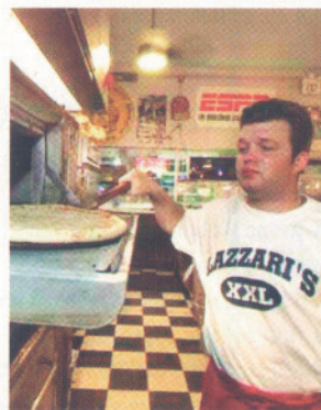
The pizza ovens at Lazzari's make it a pregame hot spot for former Huskers.

LAZLO'S BREWERY AND GRILL. Located in the historic Haymarket section of town, Lazlo's is the oldest and largest brewery in the state. On the way out of town, drop in for its renowned French dip ($8).