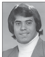
Rik Bonness Center, 1975