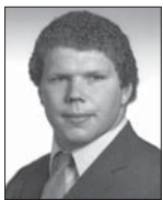
Dave Rimington Center, 1981-82