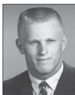
Don Fricke* Center, 1960