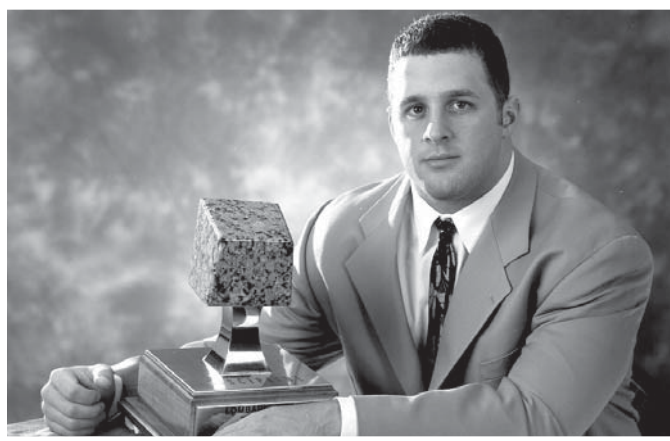
Grant Wistrom, a two-time All-American on the field and in the classroom, won the Lombardi Award and the NCAA Top Eight Award in 1998. He was also named a National Football Foundation/College Football Hall of Fame Scholar-Athlete. After leading NU to three national titles, Wistrom played in three Super Bowls.