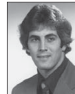
Vince Ferragamo Quarterback, 1976