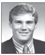
David Edeal Center, 1990