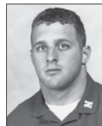
Grant Wistrom Rush End, 1996-97