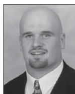
Kyle Vanden Bosch Rush End, 1999-2000