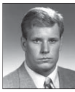
Jake Young Center, 1989