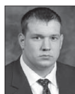
Kurt Mann Center, 2005