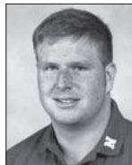
Aaron Graham Center, 1995