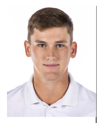
Career Bests Low Round: 66 (Tiger Collegiate, 4/10/23)

Low 54-Hole Score: 208 (Tiger Collegiate, 4/11/23)