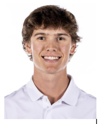
Career Bests Low Round: 69 (Badger Invitational, 9/13/22)

Low 54-Hole Score: 222 (William H. Tucker Intercollegiate, 9/24/22)