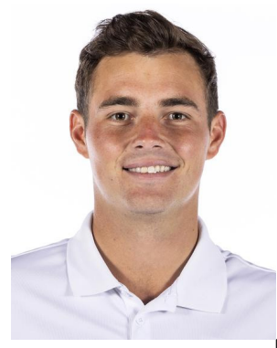
Career Bests Low Round: 68 (4x, most recent White Sands Invitational, 10/30/22)

Low 54-Hole Score: 207 (White Sands Invitational, 10/30/22)