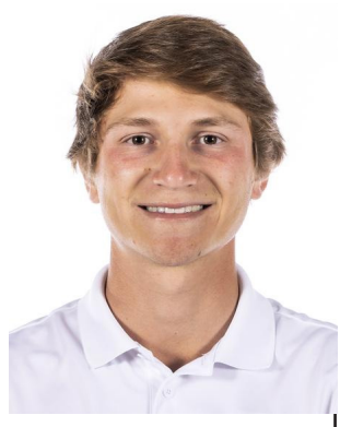
Career Bests Low Round: 67 (Stampede at The Creek, 4/10/23)*

Low 54-Hole Score: 210 (Stampede at The Creek, 4/10/23)*