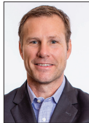
FRED HOIBERG Head Coach