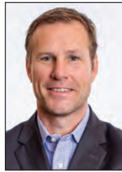
FRED HOIBERG Head Coach