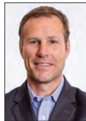
FRED HOIBERG Head Coach