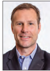
FRED HOIBERG Head Coach