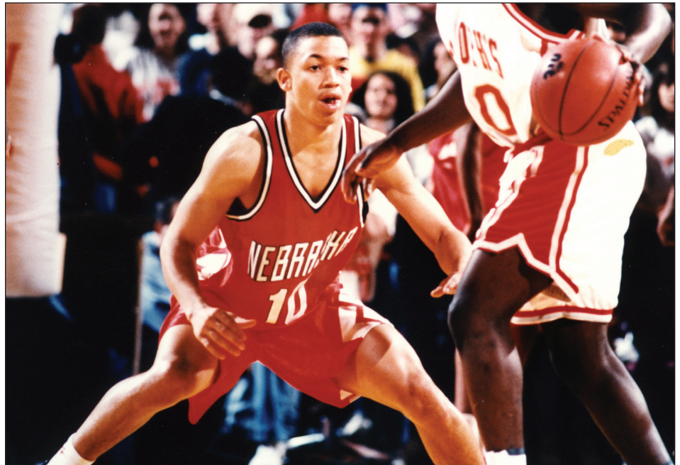
Before leaving a year early for the NBA Draft, Tyronn Lue led NU to three postseason tournament appearances. He ranks ninth on the Nebraska career scoring chart and fourth in career assists and was inducted into the Nebraska Basketball Hall of Fame in 2013.

Made: 319, 2023-24 (893 att.) Conference Made: 190, 2023-24 (503 att.) Attempted: 893, 2023-24 (319 made) Conference Attempted: 506, 2019-20 (159 made) Percentage: .397, 2009-10 (217-547) Conference Percentage: .413, 1986-87 (52-126)