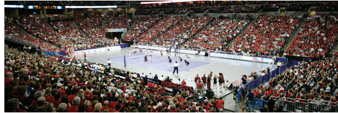
Nebraska shattered NCAA single-match and all-session records at the 2006 NCAA Championships in Omaha, drawing 34,222 for the two matches, including a then-NCAA record crowd of 17,209 for the title match against Stanford. At the time, that was the largest crowd to ever see a volleyball match in the United States.

- Cook following the national title match