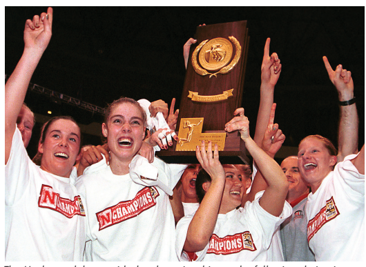
The Huskers celebrate with the championship trophy following their win over Wisconsin in the 2000 NCAA Championship match.