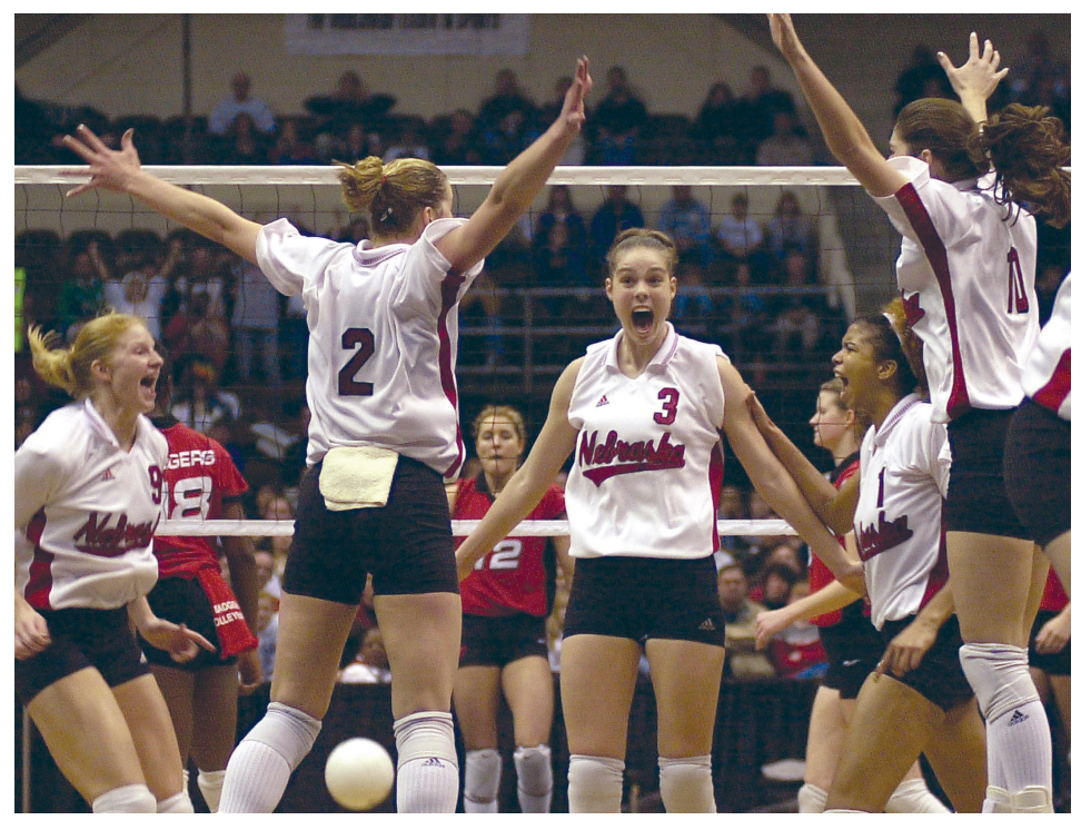
The Huskers celebrate match point against Wisconsin to win the 2000 NCAA title. Nebraska went 34-0 to earn its second national title.