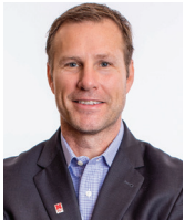
Fred Hoiberg Men's Basketball