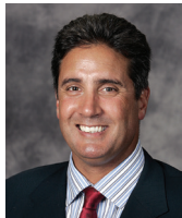
Pablo Morales Swimming and Diving