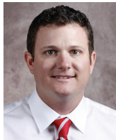
Will Bolt Baseball