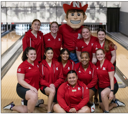
The Huskers won three tournament titles in 2022-23, including the Big Red Invitational. NU posted six top-three finishes in nine tournaments.

The Nebraska bowling program was hungry to demonstrate success throughout the season and return to the NCAA Championships.