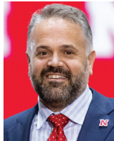
Matt Rhule Football