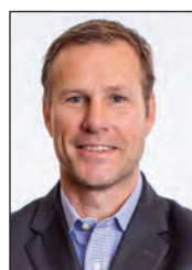
FRED HOIBERG Head Coach