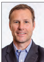
FRED HOIBERG Head Coach