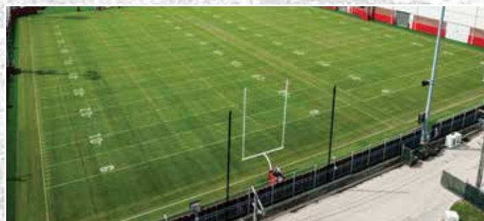
FOOTBALL GRASS PRACTICE FIELDS