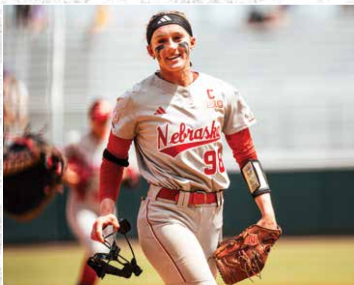
JORDYN BAHL, 2025 NFCA PLAYER OF THE YEAR BIG TEN PLAYER & PITCHER OF THE YEAR