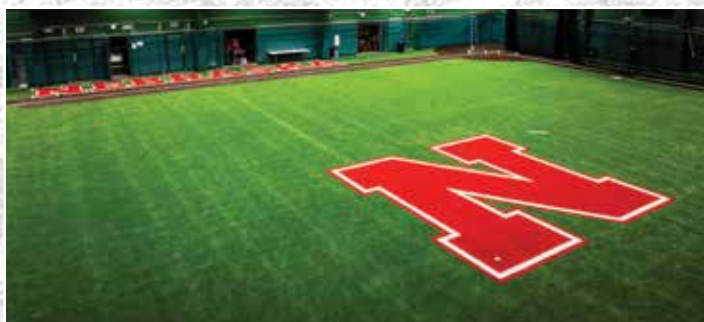
BASEBALL, SOFTBALL TURF REPLACEMENT ALEX GORDON TRAINING COMPLEX AT HAYMARKET PARK

The men's and women's golf programs also received facility upgrades with new hitting bays, putting facilities and locker rooms, while the rifle team will open the new Pershing Rifle Range in 2025-26.