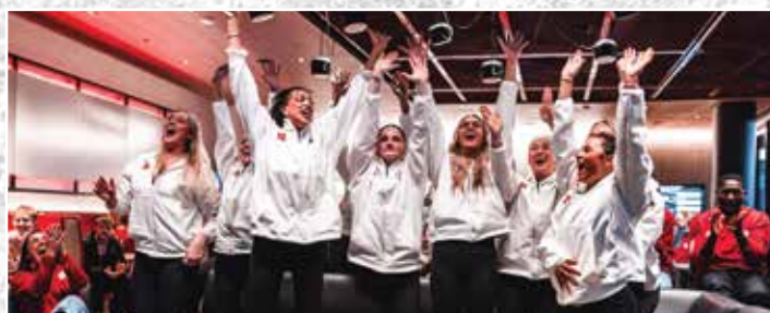
2025 NCAA WOMEN'S BASKETBALL TOURNAMENT SELECTION BACK-TO-BACK NCAA TOURNAMENT BIDS