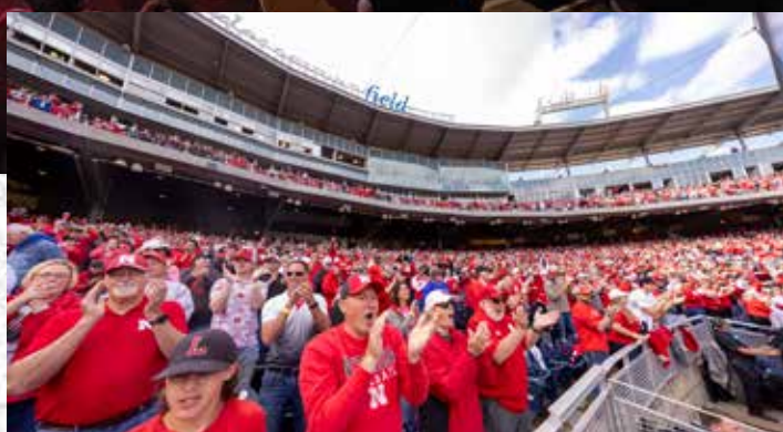
NEBRASKA BASEBALL FANS AT BIG TEN TOURNAMENT 15,139 FOR BIG RED CHAMPIONSHIP GAME WIN OVER UCLA