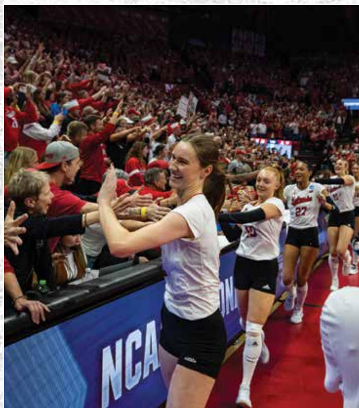
NCAA VOLLEYBALL 2024 REGIONAL CHAMPION VICTORY LAP BOB DEVANEY SPORTS CENTER, DECEMBER 15, 2024