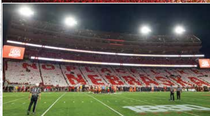
NEBRASKA FOOTBALL'S 400TH CONSECUTIVE SELLOUT MEMORIAL STADIUM, SEPTEMBER 20, 2024