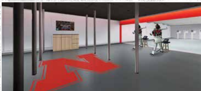
NEBRASKA RIFLE RANGE JOHN J. PERSHING MILITARY AND NAVAL SCIENCE BUILDING

The Nebraska outdoor track and field stadium also enters its final phase of construction ahead of hosting the 2026 Big Ten Outdoor Championships. Nebraska softball received significant seating upgrades to Bowlin Stadium, while the Gordon Complex received updates for both baseball and softball indoors.