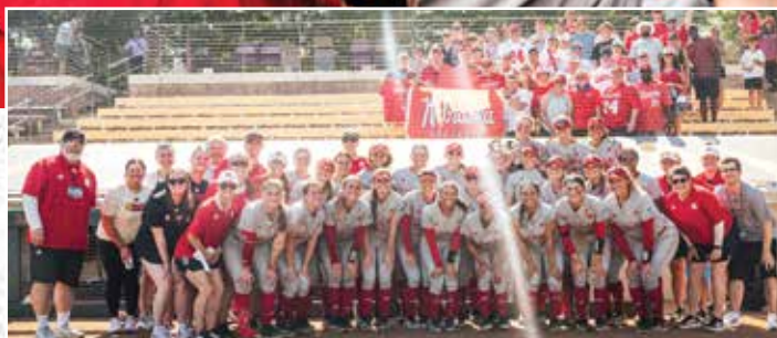
NEBRASKA SOFTBALL 2025 NCAA REGIONAL CHAMPIONS BATON ROUGE, LOUISIANA