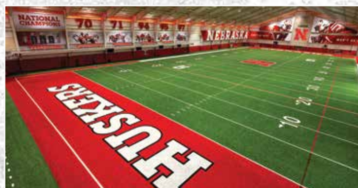
HAWKS CHAMPIONSHIP CENTER NEW TURF AND CHAMPIONSHIP RECRUITING DISPLAYS