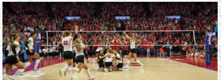
NCAA VOLLEYBALL SEMIFINALS, BIG TEN CHAMPIONS NATIONAL LEADER IN HOME ATTENDANCE