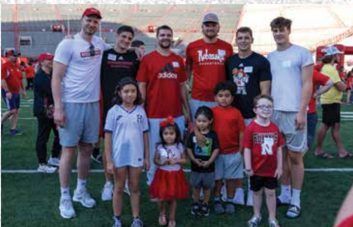
NEBRASKA MEN'S BASKETBALL PLAYERS AT THE ANNUAL HUSKER HEROES EVENT