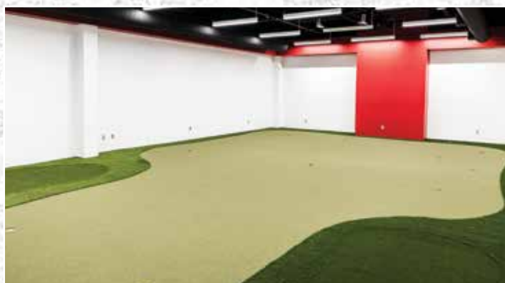
MEN'S & WOMEN'S GOLF HITTING BAYS, PUTTING FACILITY HAWKS CHAMPIONSHIP CENTER

Competitive excellence at Nebraska always has been tied to top-tier facilities, and the Huskers are renewing their commitment to first-class environments across their sports. Along with the opening of the expansive Osborne Legacy Complex in 2024-25, Memorial Stadium received new Hellas Stadium Turf for the 2025 season. The stadium also received a new videoboard at the north end of the stadium along with new studios for HuskerVision and the Huskers Radio Network in north stadium. New outdoor grass practice fields and an upgrade to the Hawks Championship Center, were also signature projects.