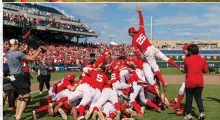
NEBRASKA BASEBALL 2025 BIG TEN TOURNAMENT CHAMPIONS OMAHA, NEBRASKA