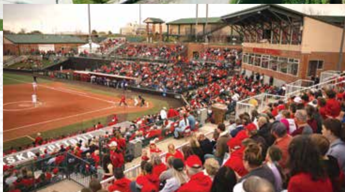
BOWLIN STADIUM EXPANSION INCREASED SEATING CAPACITY BY MORE THAN 500