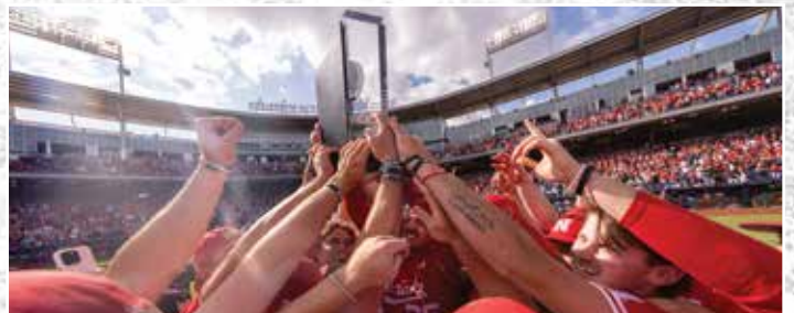
BACK-TO-BACK BIG TEN BASEBALL CHAMPIONS NCAA TOURNAMENT APPEARANCE