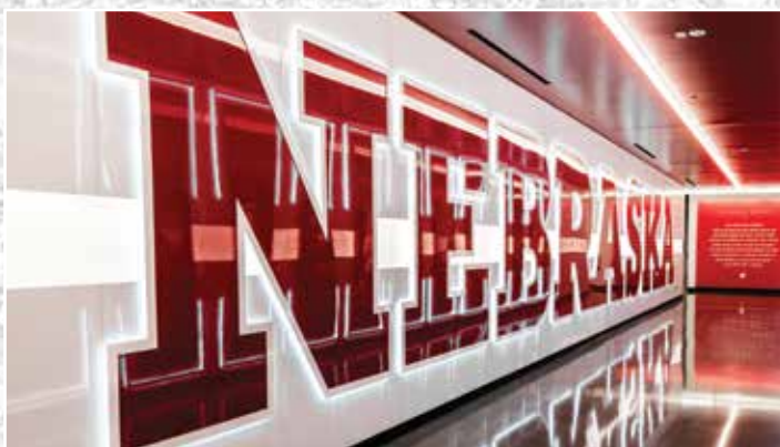
OSBORNE LEGACY COMPLEX