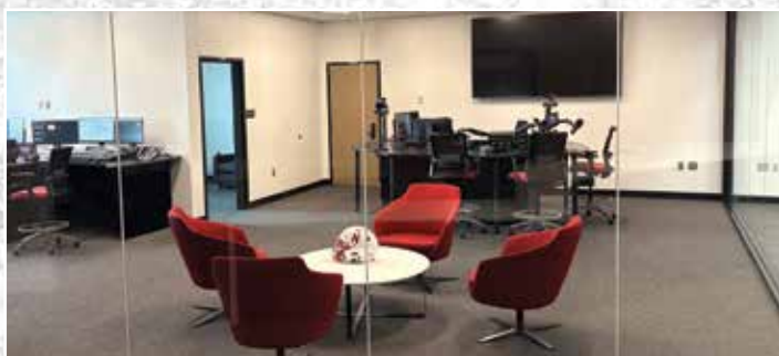
HUSKERS RADIO NETWORK STUDIO MEMORIAL STADIUM